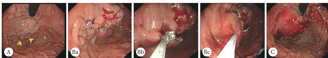
图 2 金属夹辅助“改良三明治法”治疗图例